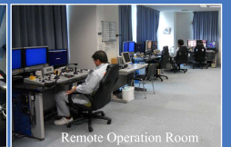
Remote Operation Room