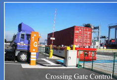
Crossing Gate Control